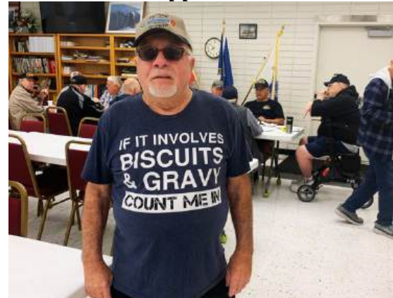
Last Wednesday of the month they serve biscuits and gravy!