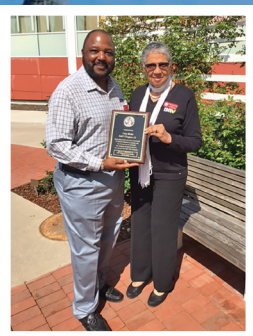
DAV'S NATIONAL COMMANDER VISITS NORTHERN CA