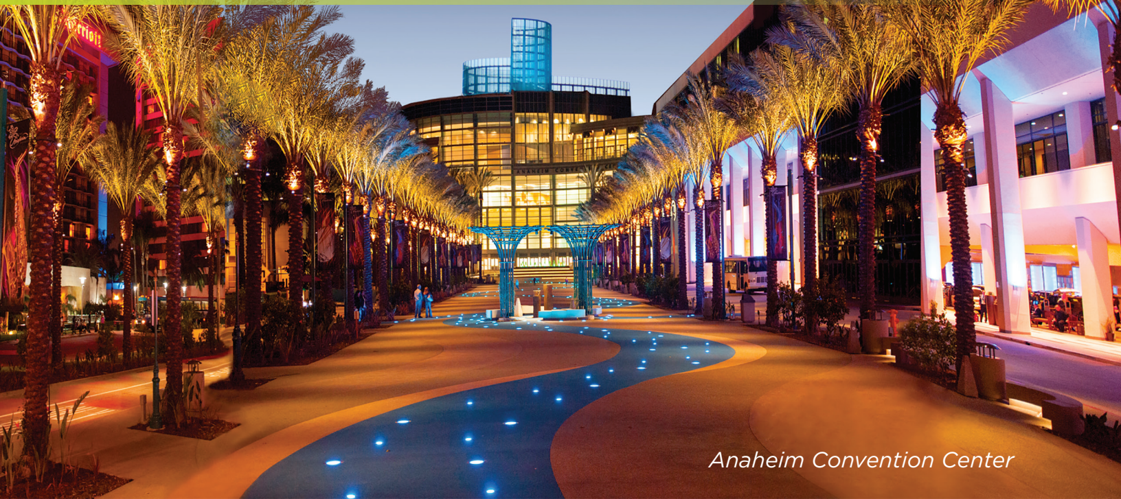
Anaheim Convention Center

Y ou won't want to miss out on our upcoming convention in Anaheim on June 8-11, 2016! We're excited to provide our attendees with the wonderful amenities and entertainment opportunities offered by the DoubleTree in Anaheim. This venue is just a mile away from Angel stadium, and right next door to the Outlets at Orange. These outlets are full of entertainment possibilities including bowling, a spa, lots of restaurants and bars, an AMC movie theatre with IMAX, and a skate park. Perhaps most importantly, this hotel is very near to Disneyland, and the DoubleTree provides a complimentary shuttle to this neighboring attraction. The hotel itself offers tasty dining at their Trofi Restaurant, an outdoor pool, a 24/7 modern fitness center, and outdoor tennis, basketball and volleyball courts. When booking your room for convention, consider lengthening your stay and make a family vacation out of it!